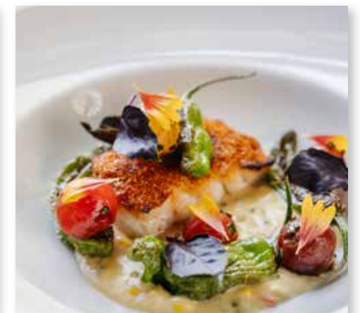
Though Yosemite is best known for its colossal waterfalls, take advantage of the peaks and valleys to hike and climb as you observe nature at its most spectacular. The Château du Sureau's grand interior features guest rooms named after herbs and flowers, each one exquisitely decorated with the finest art and antiques. Explore the beautifully landscaped grounds before dinner in the Chateau's restaurant, Elderberry House.