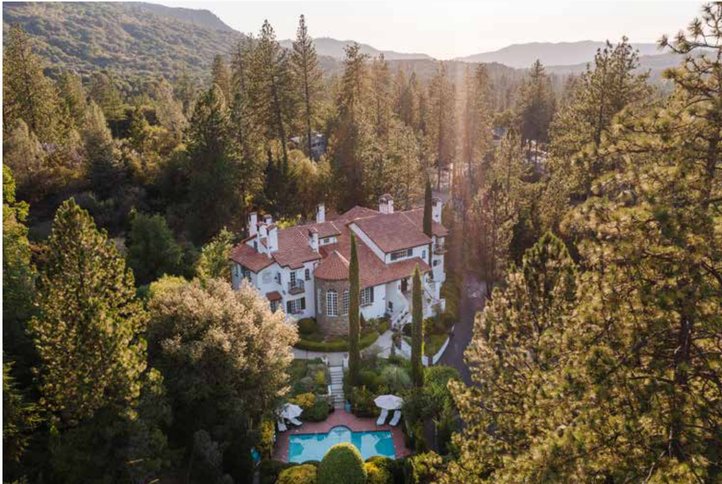
Château du Sureau, barely 16 miles from Yosemite National Park is a welcoming sanctuary. A storybook setting with enchanting gardens, towering pines, bubbling fountains, and exceptional farm to table cuisine. A stay here is an escape to a splendid, tranquil haven.